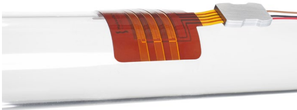
Figure 4 FHF01 fits flat and curved surfaces