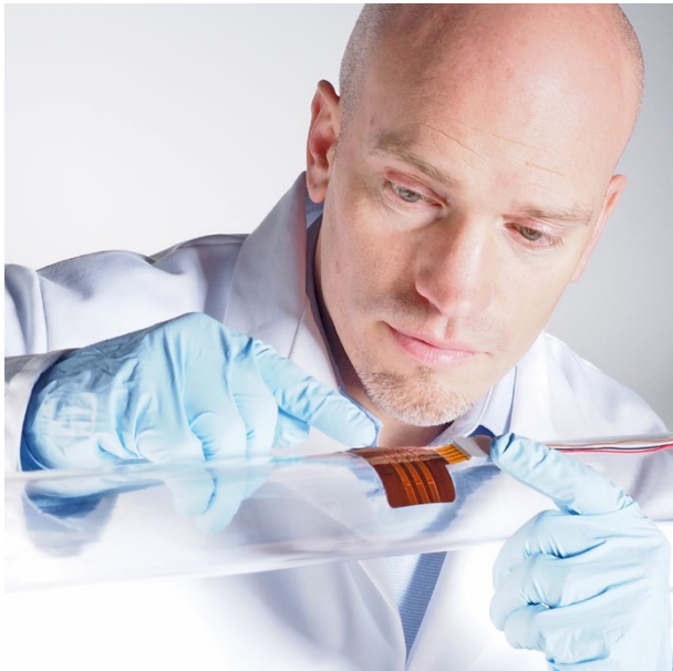
Figure 2 FHF01 being installed on a tube